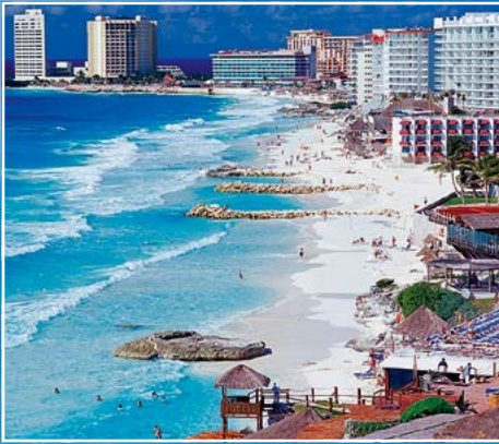
Playa Del Carmen