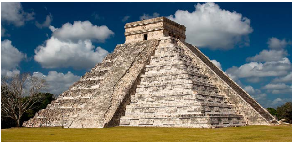
Chichen Itza is one of the most impressive Archeological Sites in the Cancun area

Chichen Itza is not the only one Mayan Archeological Sites in the Cancun area but it is one of the most impressive ones and it is now considered one of the New Seven Wonders of the World, definitely a place to see. Chichen Itza