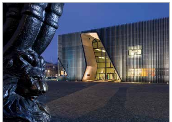
Museum of the History of Polish Jews

enjoy a traditional pasha cake and cup of coffee in one of the best Jewish restaurants in Warsaw. (Not suitable for those planning to attend the ITPG meeting).