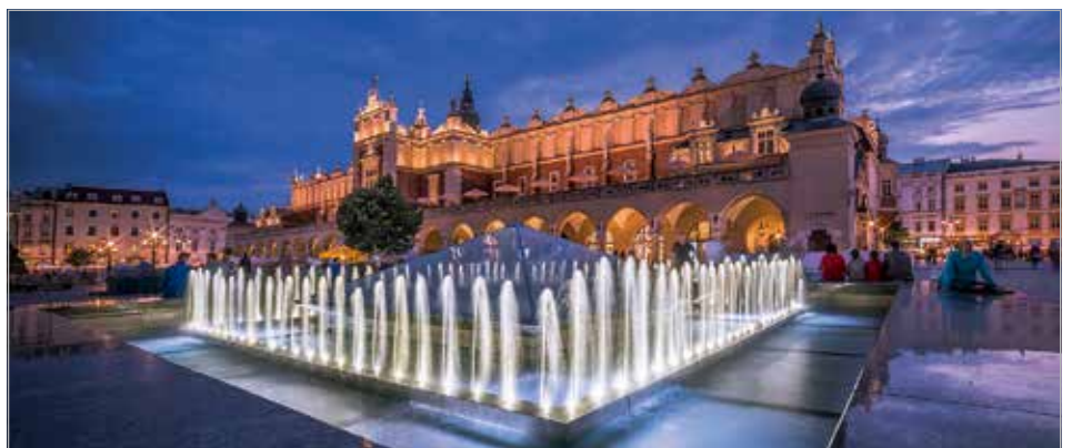
Krakow – Cloth Hall Sukiennice

On a rocky height overlooking the Vistula river, the defensible Wawel Hill is said to have been kept out-of-bounds by a legendary dragon living in a cave below it. The city was the seat of the Polish monarchy and the country's capital until 1596. Thanks to the fortuitous absence of major catastrophes, Kraków's heritage remains fully intact for today's visitor to enjoy. Listed by UNESCO as a World Heritage Site with an enchanting Old Town, Wawel Castle and the Cathedral complex (where kings of Poland and national heroes lie buried), and one of medieval Europe's largest market places with its Renaissance Cloth Hall and