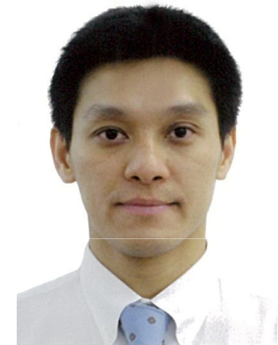
Anuphan Kitnitchiva Monchai Vachirayonstien

900 Tonson Tower, Floor 12, Ploenchit Road, Lumpini, Patumwan 10330 Bangkok Thailand