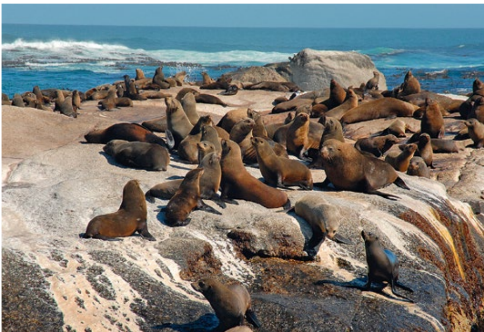
Boat Cruise to Seal Island

Option A (14:00 – 17:00) – Seal Island Boat Cruise (only for pre-registered participants): Situated only 8 nautical miles (about 16 kms) from Simon’s Town, Seal Island is home to 75,000 Cape fur seals, 24 different bird species and the hunting ground of the great white shark. En route to the island the views are truly spectacular, with Cape Point in the distance to your right, Table Mountain and the Constantia wine route to your left and ahead, the majestic Hottentot’s Holland mountain range.