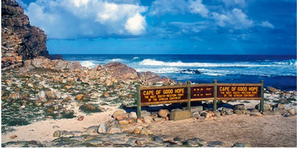
Cape Peninsula Tour

The Fairest Cape / Cape Peninsula Tour, 10:00 – 16:00: Travel along the spectacular coastline of the Peninsula through charming historical villages. Visit the mythical meeting place of two great oceans and experience the “fairest Cape of all”. Highlights of The Cape Peninsula Tour: Clifton Beach and Camps Bay, Twelve Apostles, Llandudno, Hout Bay, Chapmans Peak Drive, Noordhoek ostrich viewing, Cape of Good Hope Nature Reserve, Cape Point, Cape of Good Hope, Simons Town, Muizenberg Constantia and the Kirstenbosch Botanical Gardens.