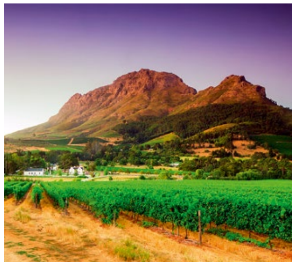
Vineyards of Stellenbosch