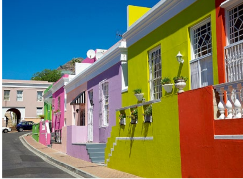
Bo Kaap – Malay Quarter in Cape Town

With an experienced and knowledgeable guide, and from the comfort of an air-conditioned vehicle, you will be able to learn more about the Cape Town Central Business District and its surrounds.